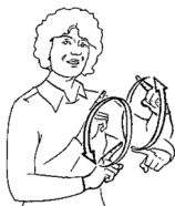
SIGN, SIGN LANGUAGE